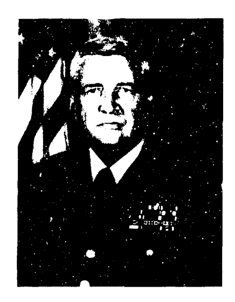
LTG Charles W. Bagnal