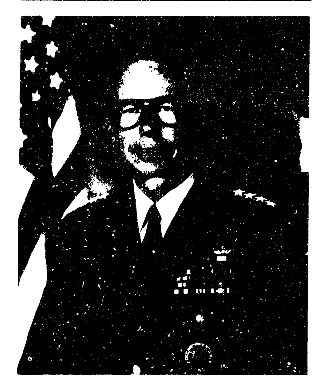
General Maxwell R. Thurman Commanding General United States Army Training and Doctrine Command 29 June 1987 — 1 August 1989