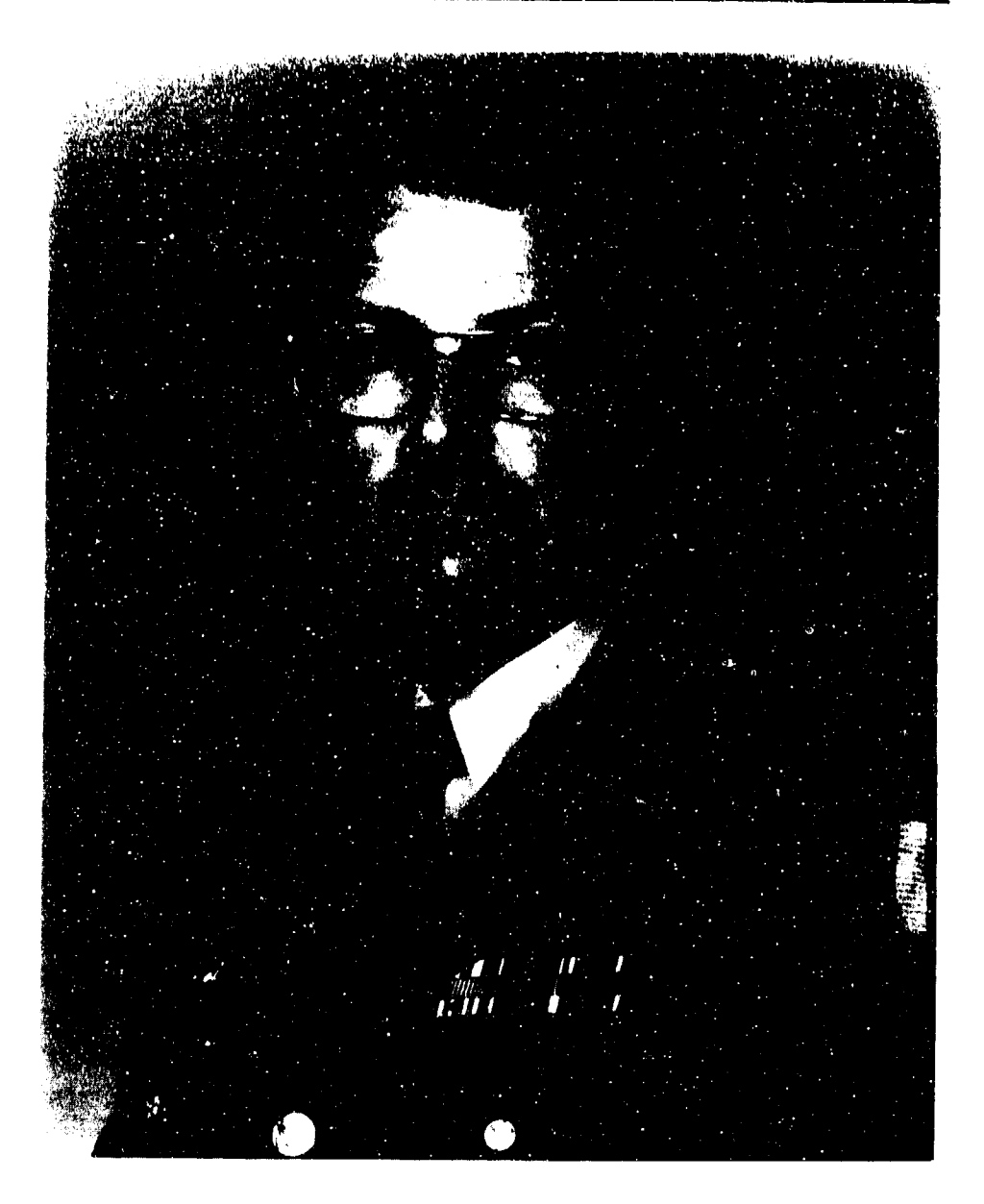
General Donn A. Starry Commanding General United States Army Training and Doctrine Command 1 July 1977 — 31 July 1981