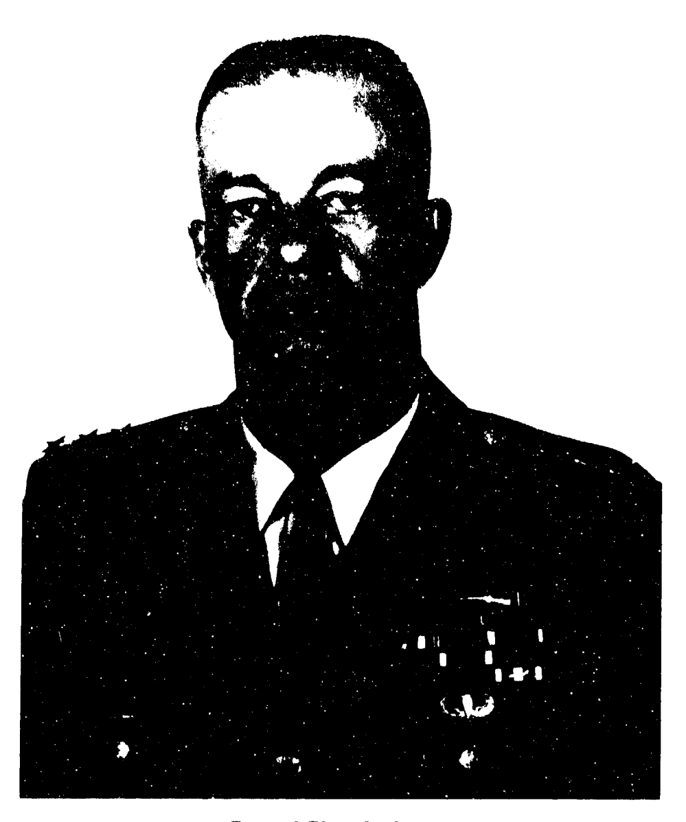
General Glenn K. Otis Commanding General United States Army Training and Doctrine Command 1 August 1981 — 10 March 1983