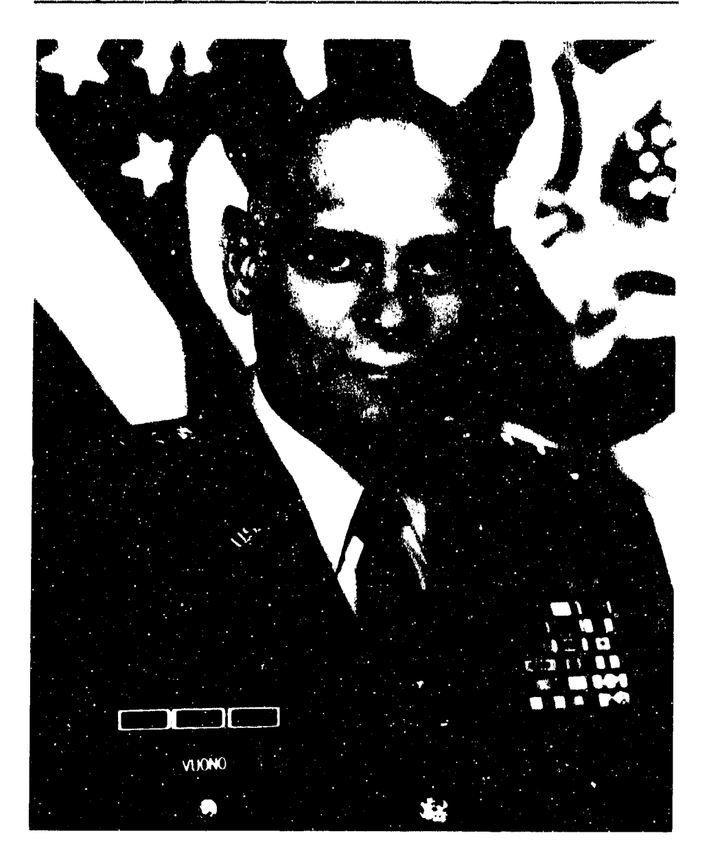
General Carl E. Vuono Commanding General United States Army Training and Doctrine Command 30 June 1986 — 12 June 1987