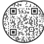
TRADOC KM Pubic Site

950 Jefferson Avenue Fort Eustis, VA 23604-1157 (757) 501-6135 https://www.tradoc.army.mil/ocko/