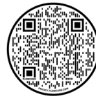
TRADOC KM (KM Documentary on Vimeo)