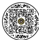
KM Training and Development Portal Events Calendar

The vision for TRADOC Knowledge Management is, "...a knowledge-enabled workforce that shares what it knows, continuously learns, and innovates."